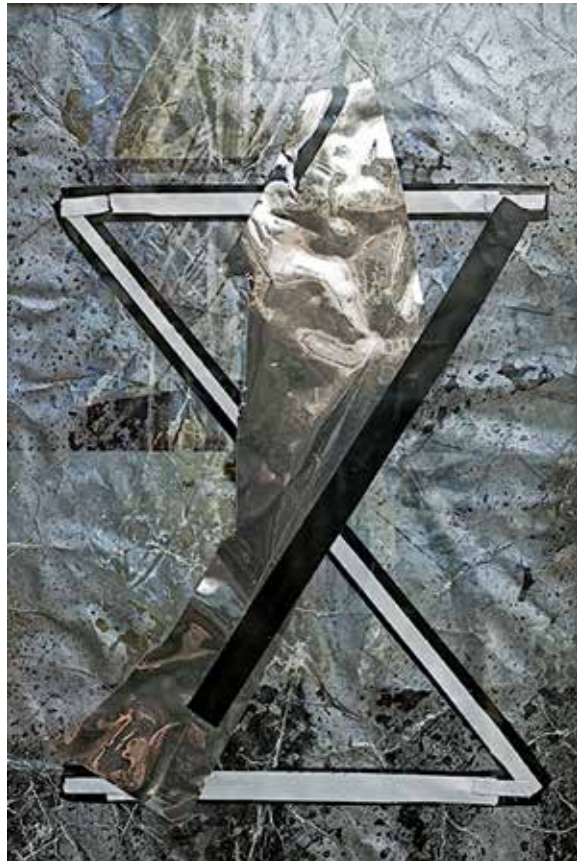
treating pictures like wire 2 2015 mixed media 30,5 x 45,7 cm unique