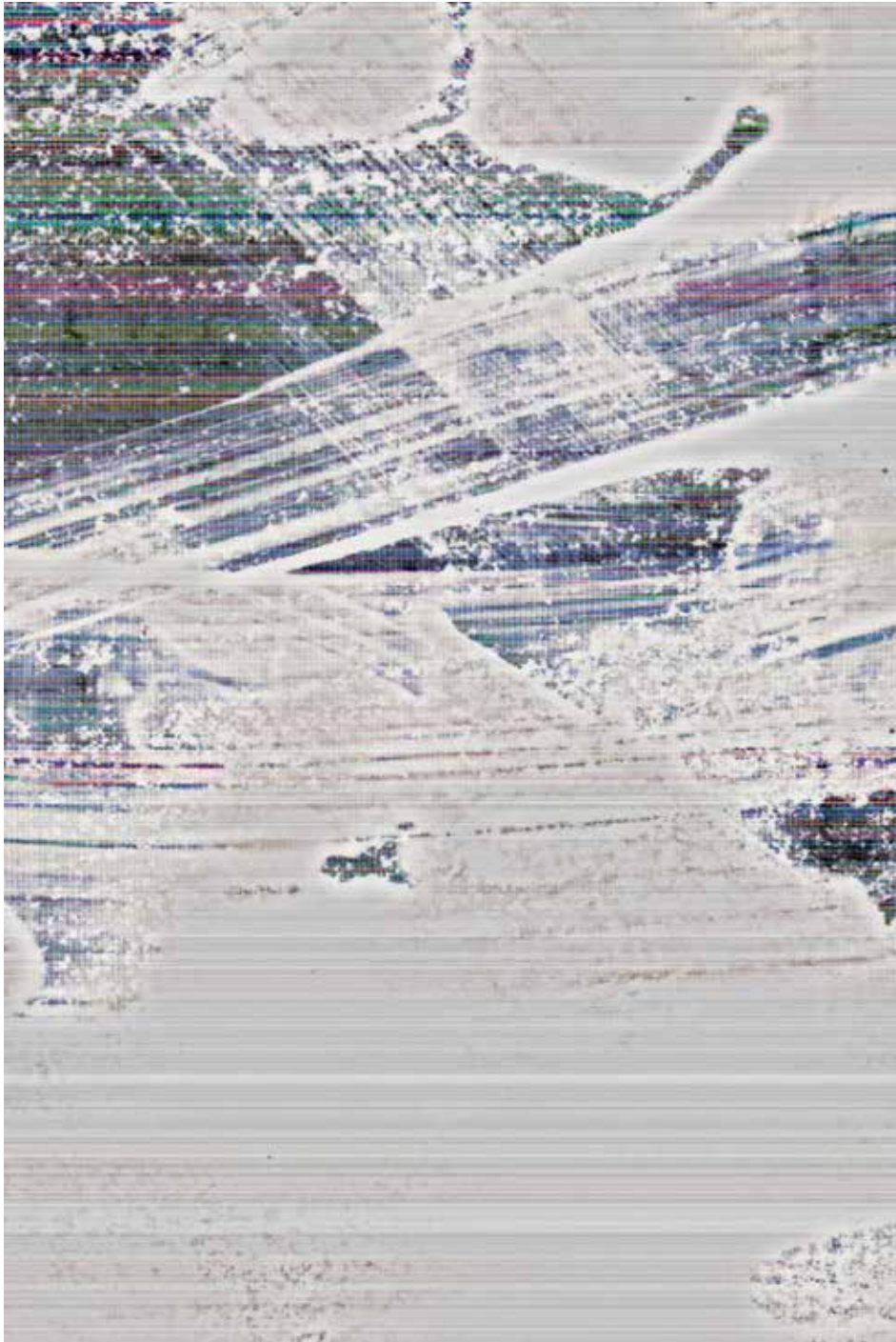
activated void series; commodity 2015 print 30,5 x 45,7 cm ed. 3+1 ap