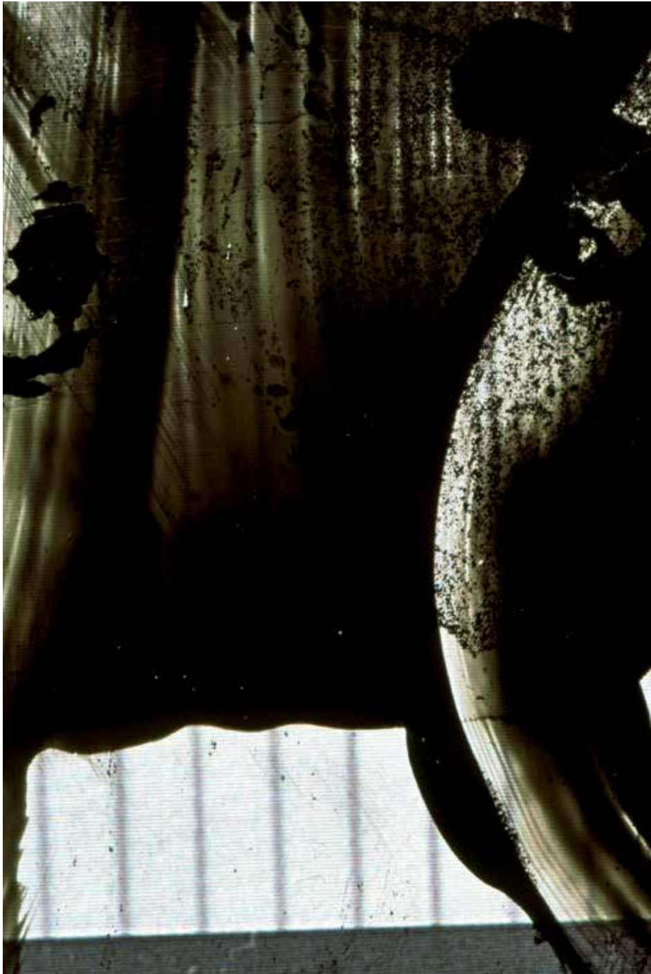
x-ray #38 2015 print 30,5 x 45,7 cm ed.3 + 1ap