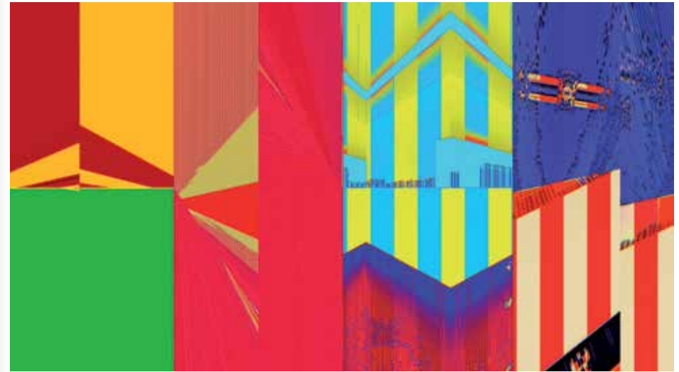
four cardinal points 2015 moving image installation (still) dimensions variable 36'24" ed. 3 + 1 ap

As an artist being capable of using such an extensive variety of media, ranging between analogue to digital, sound to visualization and finally materiality to immateriality, one could easily get lost in all these options and opportunities to use as means of expressions. Garets however uses this spectrum virtuously and with a playful easiness, consequentially developing his own significant artistic language, guiding the viewer's perception to entirely new fields of interdisciplinary contemporary art.