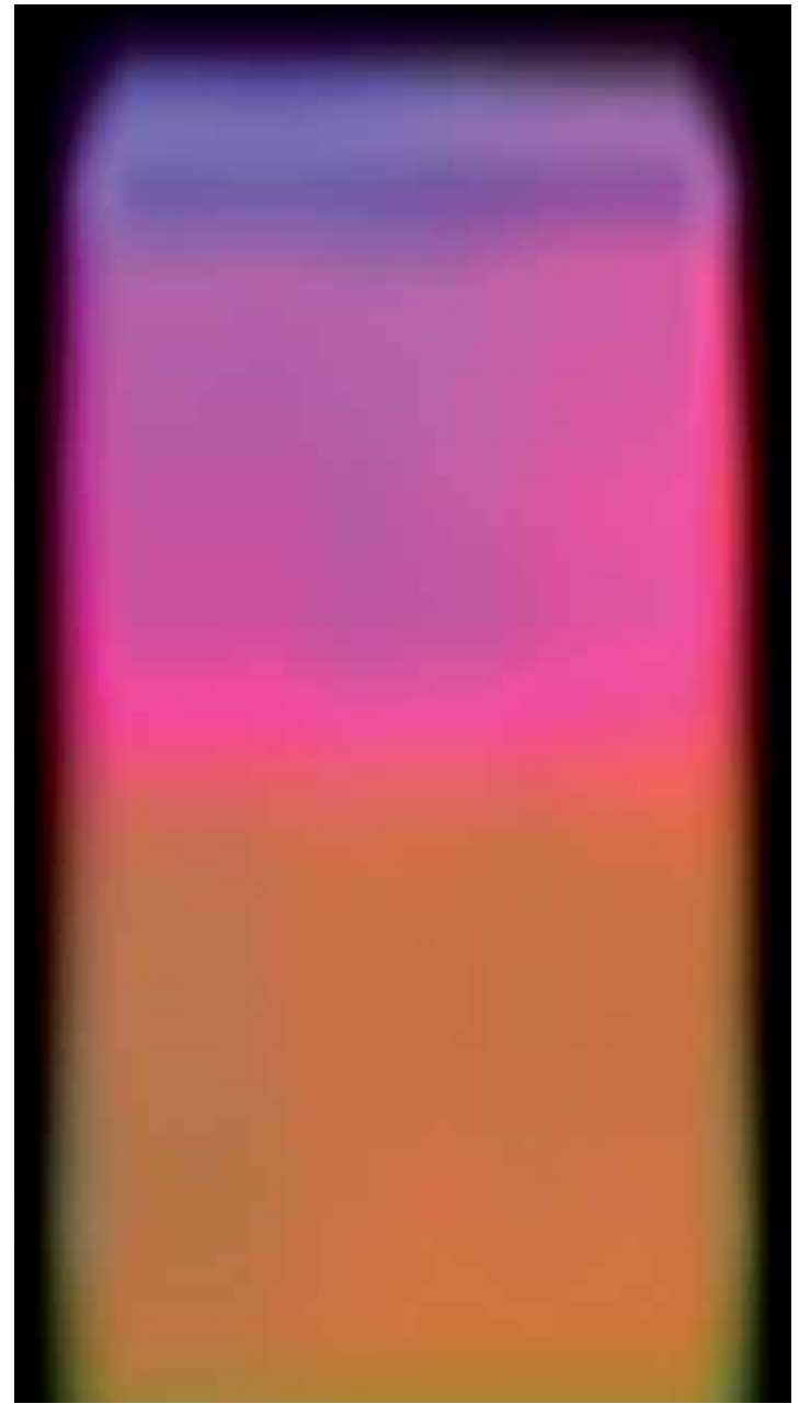
perceptual series; glowing wedge 2015 moving image installation (still) dimension variable 37' 06" ed. 3 + 1 ap