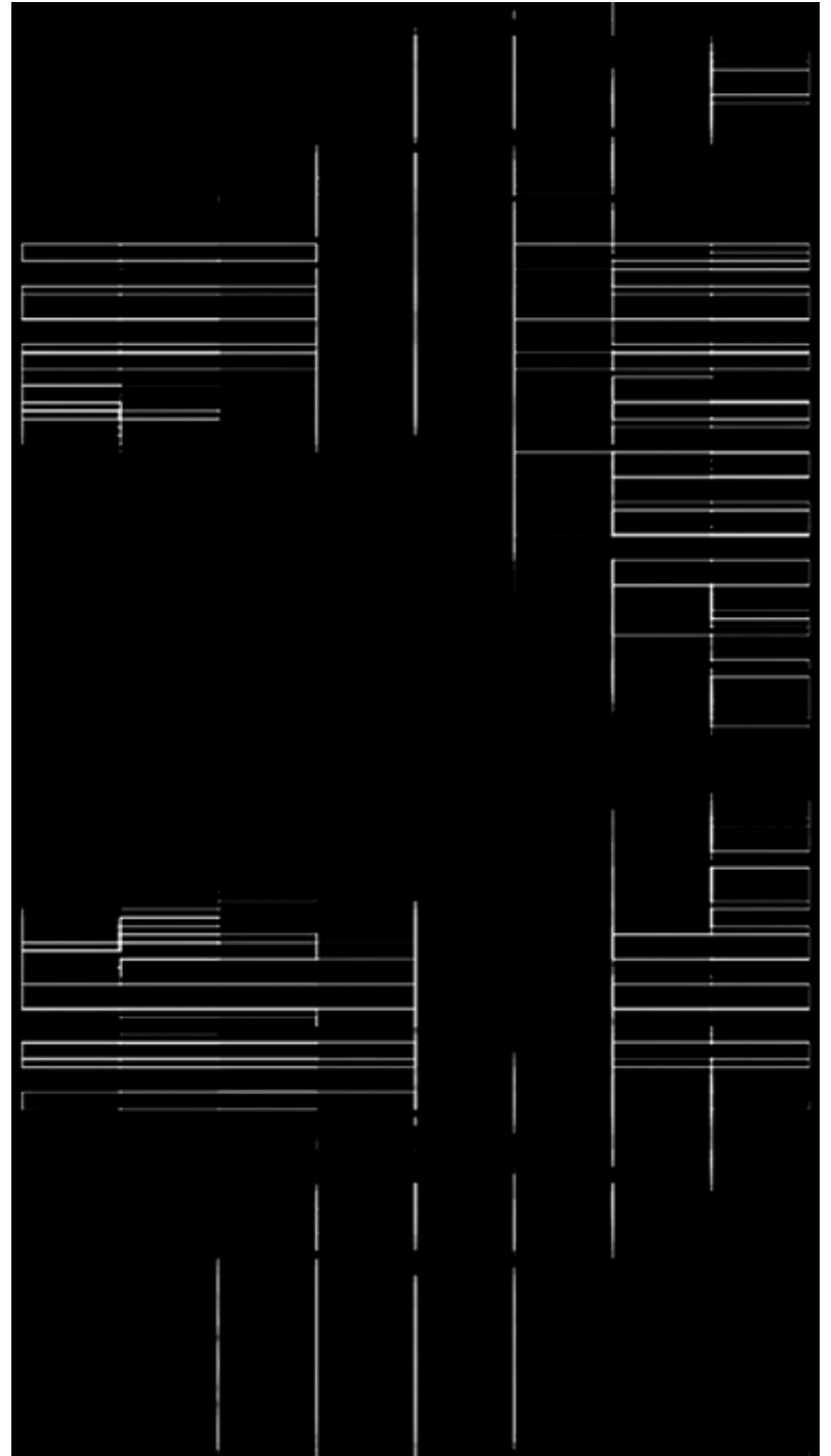
glint 2012 moving image installation (still) dimension variable 44'00" ed. 3+1 ap