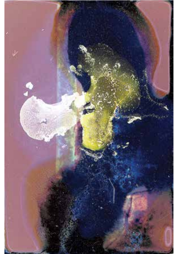
untitled series; painting semiotics, slide #25 2012 dimensions variable multimedia installation ed.3+1ap